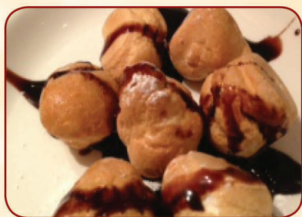
Chocolate Profiteroles £3.90