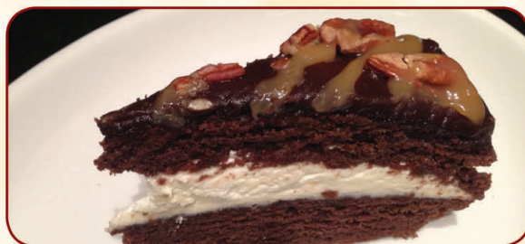
Chocolate Brownie Cake £3.90