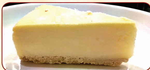
New York Cheese Cake £3.90