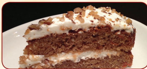
Carrot Cake £3.90