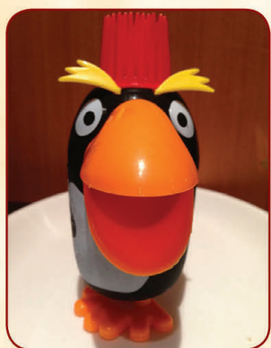
Punky Vanilla ice-cream £3.50