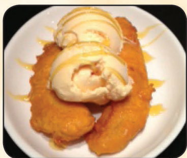
Banana or Pineapple Fritters & ice-cream £4.50